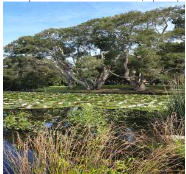
Lake in Centennial Park, Sydney