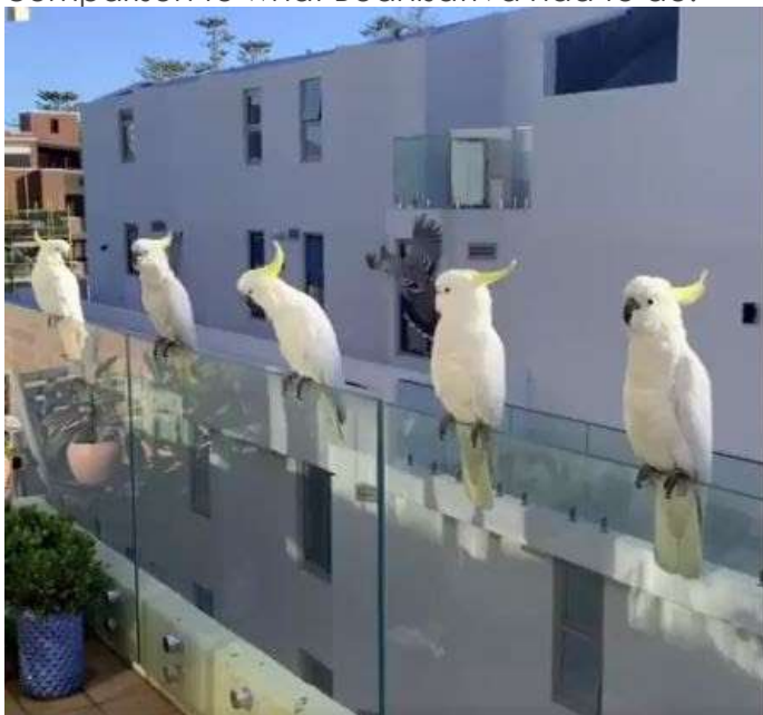
Social distancing cockatoo style

Washing your hands for 20 seconds is nothing in comparison to what Bodhisattva had to do.