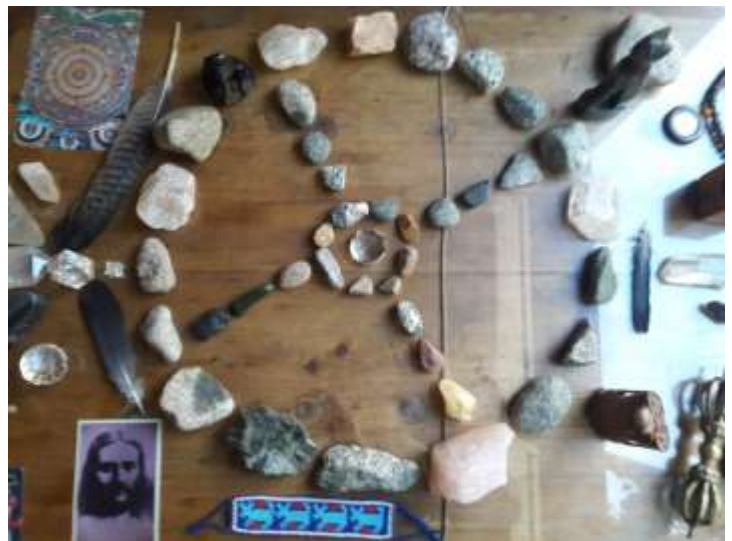
Medicine Wheel in Purvesh's Home in Argentina.