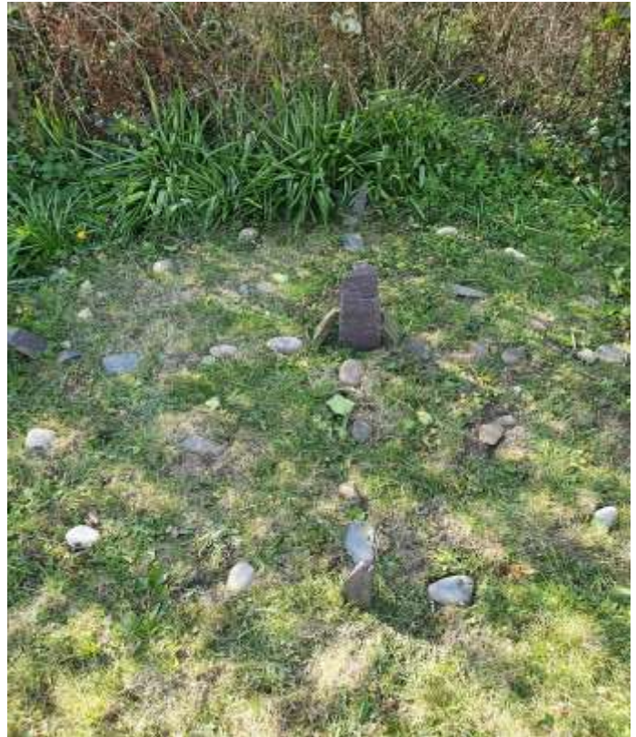
Stephen's garden medicine wheel

Until next month – Together in Unity Consciousness Stephen