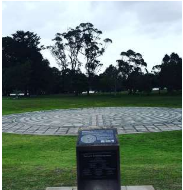
Labyrinth in Centennial Park, Sydney