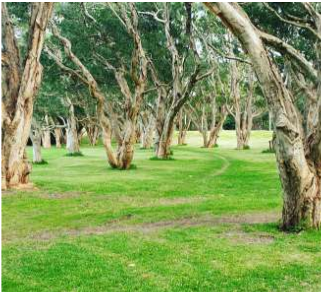
Peace in Centennial Park, Sydney