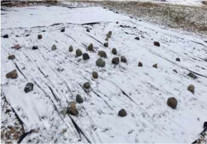
Chad in Minnesota created this wheel. It looks wonderful even in the snow.