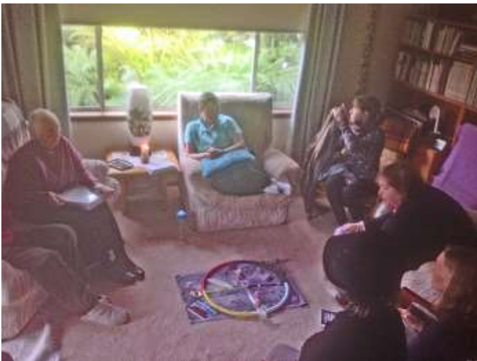
There were 9 people at the Sydney PCOL reactivation meditation in August.