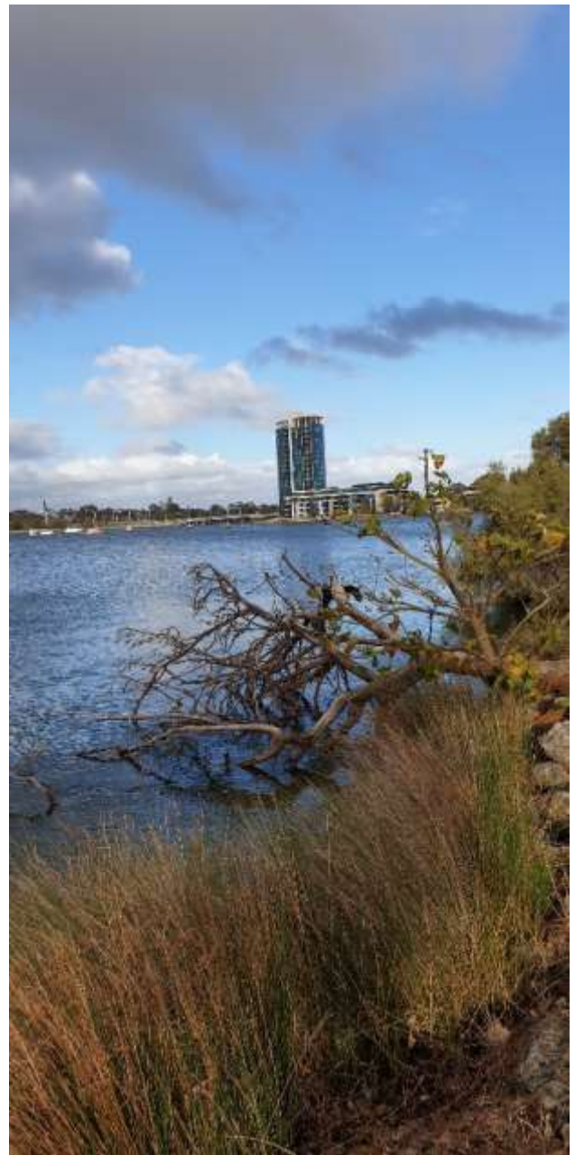
Scene from the seminar room of the Canning River.