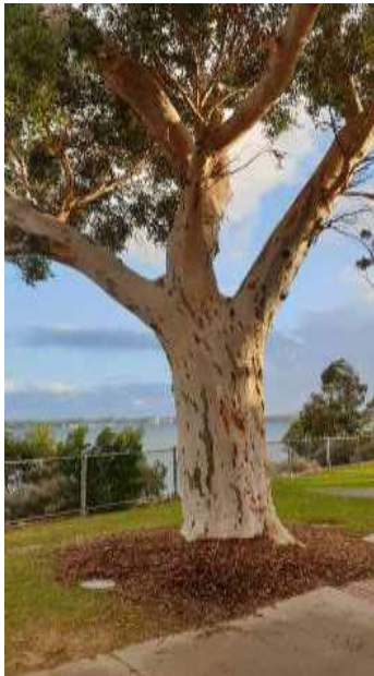
Beautiful tree outside the seminar room.