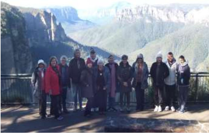
Grose Valley May 2019 - Members and guests at the re-activation of PCOL