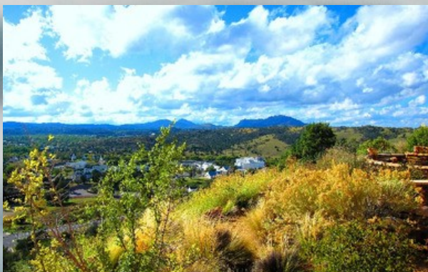
View from Prescott Resort Terrace