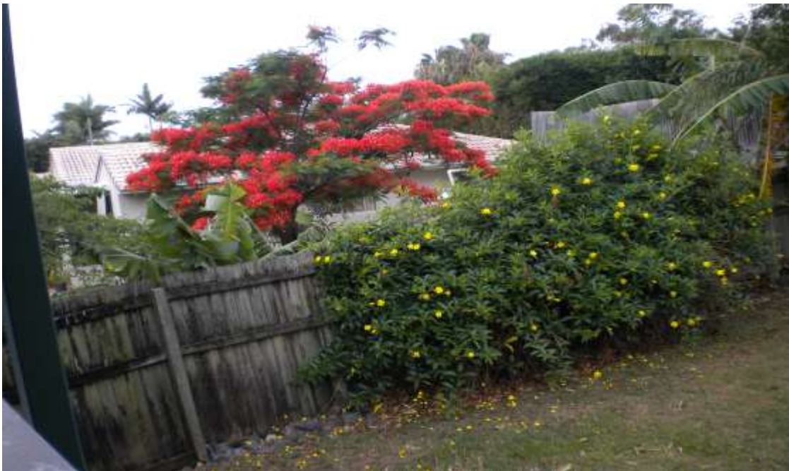
Flame Tree in the south corner of the PCOL at Helensvale.