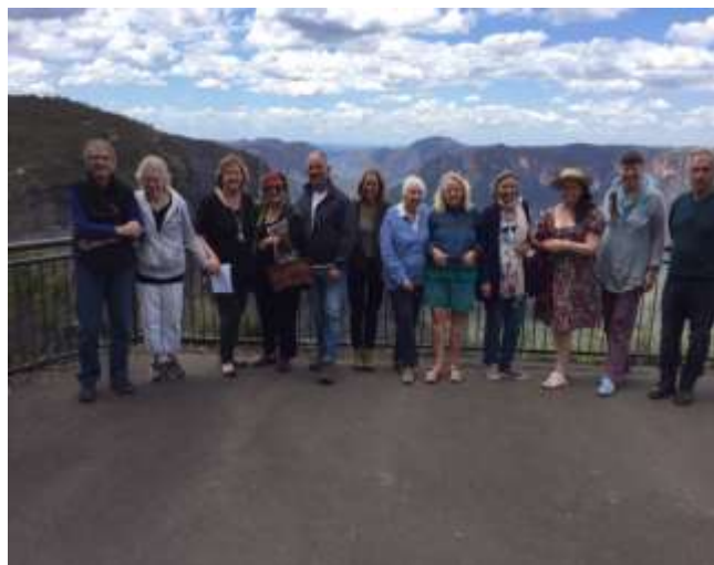
Lovely group of members and guests.