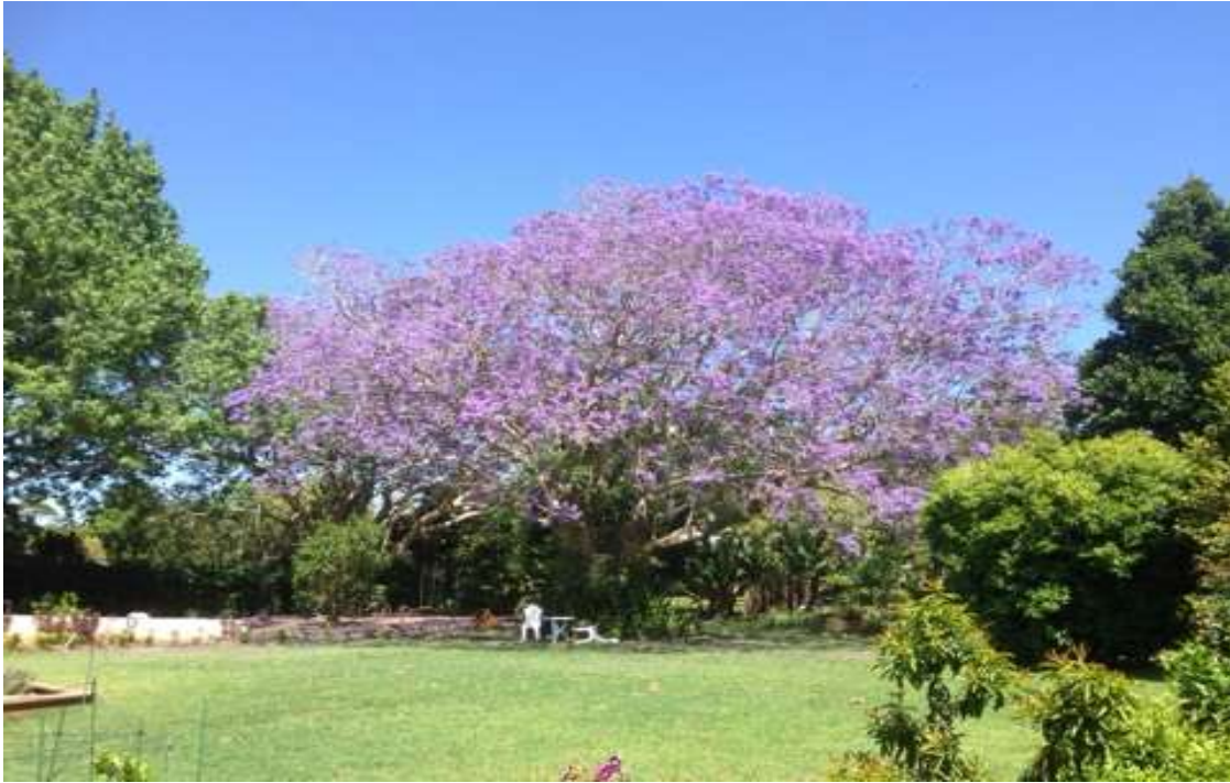
Jacaranda Tree in the west corner of the PCOL, at Tamborine Mountain.